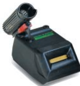
clean-o-point® (stop + go) Motorised tip cleaner with iron holder, stop+go switch and sponges. Ready for mains connection.