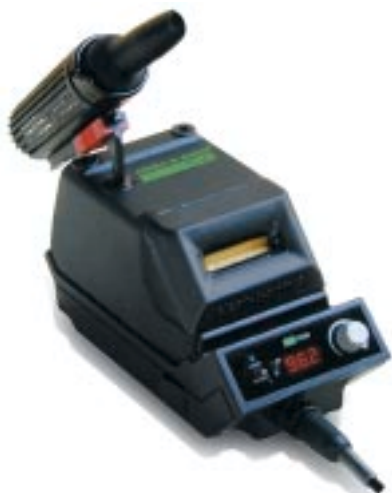
Hi-Tech soldering station 911D /digital Ready for use! Control unit with digital temperature display, stand-by switch, motorized tip cleaner, stop+go iron holder, soldering iron and power supply. Tip S 2.0 mm.