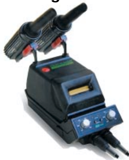
Twin soldering station 912A / analog Ready for use! Control unit with 2 independent automatic control systems with 2 temperature scales, 2 stand-by switches and motorized tip cleaner, 2 soldering irons and power supply. Tips S 2.0 + C 0.8 mm.