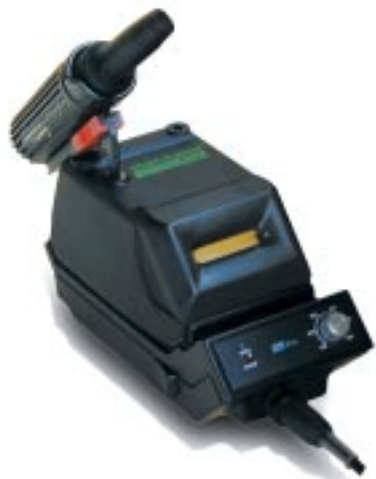
Hi-Tech soldering station 911A / analog Ready for use! Control unit with temperature scale, stand-by switch, motorized tip cleaner, stop+go iron holder, soldering iron and power supply. Tip S 2.0 mm.