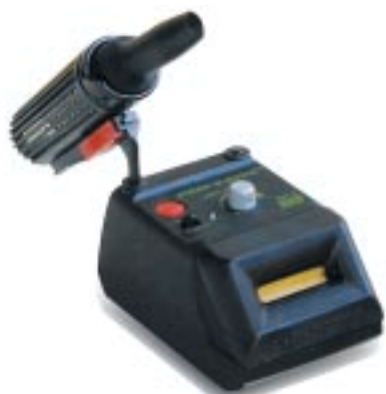
ECO soldering station 921A / analog Ready for use! Motorized tip cleaner with control unit with temperature scale and stand-by switch, soldering iron and power supply. Tip S 2.0 mm.