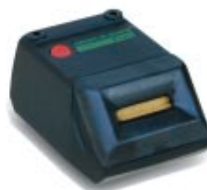
clean-o-point® (standard) Motorised tip cleaner with mains switch and sponges. Ready for mains connection.